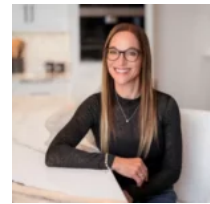
Jodi Adashun Jones, Inc.