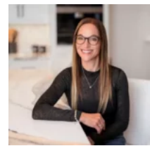
Jodi Adashun Jones, Inc.