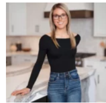
Jada Adashun Jones, Inc.