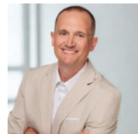
Scott Adashun Jones, Inc.