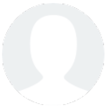
Tom Score Realty Group, LLC