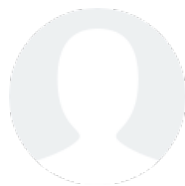
Ben Symes Realty, LLC