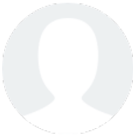
Carrie Acre Realty, Ltd.