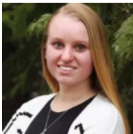
Krista Adashun Jones, Inc.

Great investment opportunity! Owner occupy, or great rental history makes this duplex the perfect investment! Located in the Town of Lamartine within the well desired Oakfield School District. Featuring a 3 car garage, some newer flooring, newer holding tanks, great country, half acre lot. Own this great duplex today!