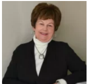
Therese Adashun Jones, Inc.

ALL THE EXTRAS YOU CAN DREAM OF ARE HERE! THIS 3-4 BEDROOM COUNTRY HOME OFFERS A GREAT RM W/TOWERING FIREPLACE, WOOD CEILING & BUILT-INS! A FABULOUS KITCHEN, SUNROOM, FINISHED BASEMENT & A 26X40 EXTRA GARAGE! YOUR DREAM COME TRUE