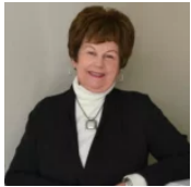
Therese Adashun Jones, Inc.

Heating and Cooling = Hot Water. SERENITY IS FOUND HERE! THIS 3 BDRM 2.5BATH STORY AND A HALF IS LOADED W/GREATDESIGN FEATURES AND IS LOCATED IN THE MOST PRIVATE SETTING YOU COULD WISH FOR. ENJOY A FIRST FLOOR MASTER SUITE, GREAT RM W/WOOD CEILING, SUNRM & PRIVATE DECK.