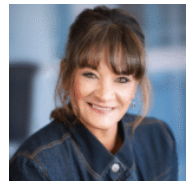
Maureen Adashun Jones, Inc.