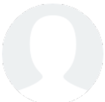
Stephanie Score Realty Group, LLC