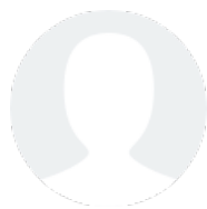
Tom Score Realty Group, LLC