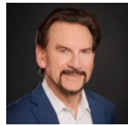
Frank Adashun Jones, Inc.