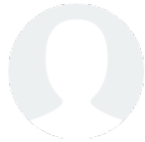
Ryan Corbett Realty