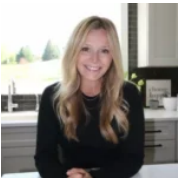
Kelly Adashun Jones, Inc.