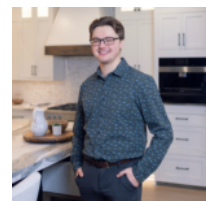
Glenn Adashun Jones, Inc.