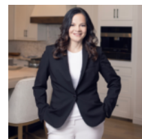
Sarah Adashun Jones, Inc.