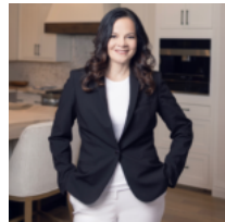
Sarah Adashun Jones, Inc.