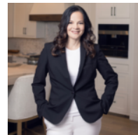
Sarah Adashun Jones, Inc.