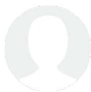
Tom Adashun Jones, Inc.