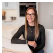
Jodi Adashun Jones, Inc.