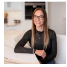
Jodi Adashun Jones, Inc.