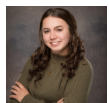
Nicole Adashun Jones, Inc.