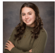
Nicole Adashun Jones, Inc.