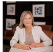
Jan Adashun Jones, Inc.

FABULOUS WALK OUT RANCH! HILLSIDE ESTATES IN ST PETER IS THE SETTING FOR THIS 1+ ACRES LOT AND 3 BEDROOM HOME. LOWER LEVEL WALKS OUT TO EVERY GARDENER'S PARADISE. 2ND GARAGE FOR THE TOYS OR BOAT STORAGE. NICE FIND!