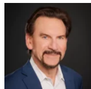
Frank Adashun Jones, Inc.