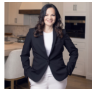
Sarah Adashun Jones, Inc.