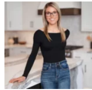
Jada Adashun Jones, Inc.