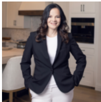
Sarah Adashun Jones, Inc.