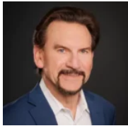
Frank Adashun Jones, Inc.