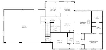
FIGURE 1: FLOOR PLAN OF HOUSE AND GARAGE. MEASUREMENTS GIVEN IN FEET AND INCHES.