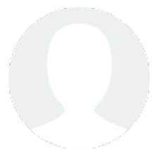
Thomas First Weber, Inc.