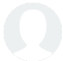
Robin First Weber, Inc.