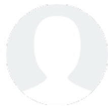
Thomas First Weber, Inc.