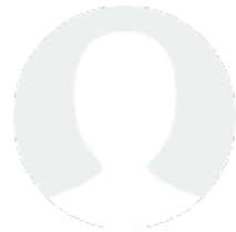
Robin First Weber, Inc.