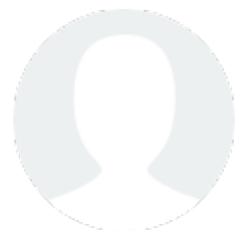
Thomas First Weber, Inc.