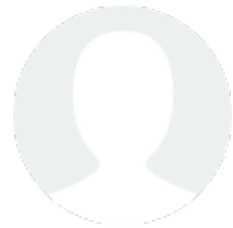
Robin First Weber, Inc.