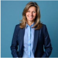
Gail Adashun Jones, Inc.