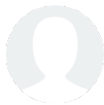
Jim Oskey Realty LLC