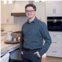
Glenn Adashun Jones, Inc.