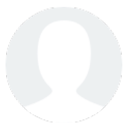
Listing Adashun Jones, Inc.