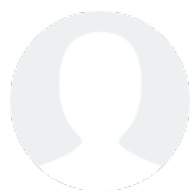
Tim Besaw Properties, Ltd