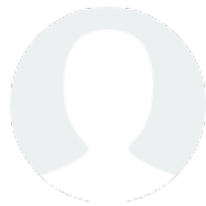
Mike Dallaire Realty