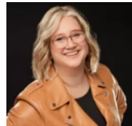
Laura Adashun Jones, Inc.