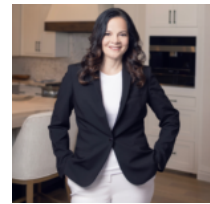
Sarah Adashun Jones, Inc.