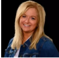
Colette Adashun Jones, Inc.

Land Your New Home Here! Gorgeous Rural Established Neighborhood awaits your new build. Wait to you see the scenic country views you will have from your front windows every day. Only one lot left!