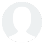
Mike Dallaire Realty