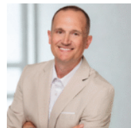
Scott Adashun Jones, Inc.