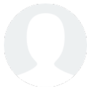
Ben Dallaire Realty