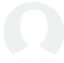
Jordan Beiser Realty, LLC