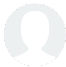
Andy Beiser Realty, LLC