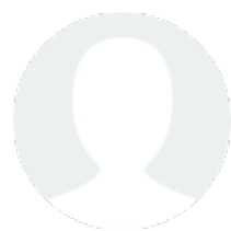
Andy Beiser Realty, LLC