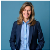
Gail Adashun Jones, Inc.