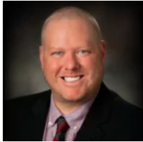
Chris Adashun Jones, Inc.