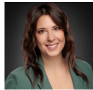
Dani Adashun Jones, Inc.