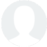
John First Weber, Inc.